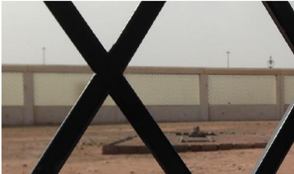
Figure 2 18 - Picture of Hamza ibn Abdul Muttaleb's grave, the uncle of the Prophet inside the enclosure at Mount Uhud cemetery. Hamza was killed in the Battle of Uhud that took place in the year 625 AD defending the Prophet, along with other martyrs who are buried in unmarked graves around him.