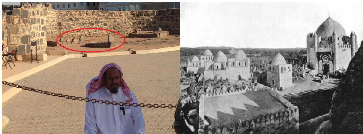
Figure 1- Picture on the left is a recent photo of the Baqi cemetery 13 . The red circle indicates the graves of the four Shi'ite Imams and one of the uncles of the Prophet. Picture on the right is the Baqi cemetery before its destruction 14

The Baqi cemetery was raided once again in 1925 by the Ikhwan, (the Brothers) who were supported by the Saudi ruling family at the time, 10 destroying the tombs and shrines that were rebuilt by the Ottomans (refer to timeline pg 6). Today, only men are allowed to visit the Baqi cemetery during early sunrise hours. The cemetery is guarded by security and mutawa, religious police, as shown in Figure 1, who debate their extreme views with visitors and do not tolerate "unIslamic" acts that are contrary to the Wahhabi principle. Shi'ites have marked the 8 th of Shawal, 11 as the Day of Sorrow, which is commemorated annually as protest against the destruction of the shrines of their revered Imams. 12